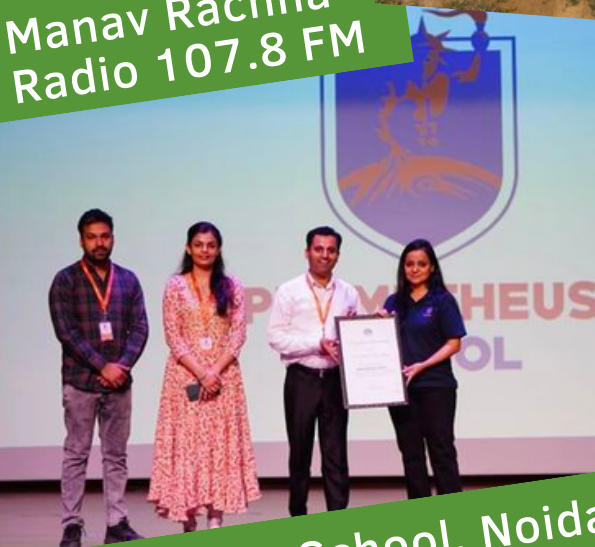
Promtheus School, Noida