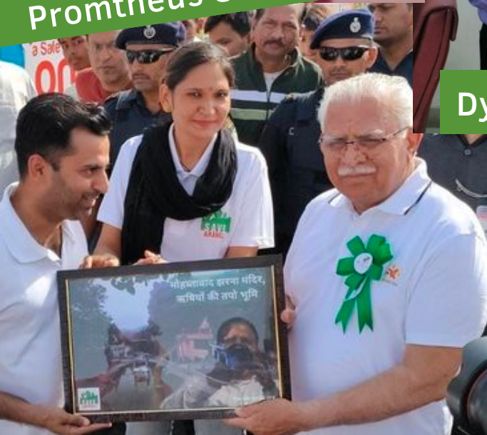
Dyal Singh College, DU