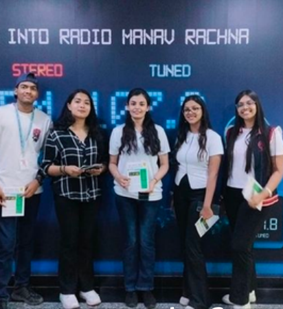
Manav Rachna Radio 107.8 FM