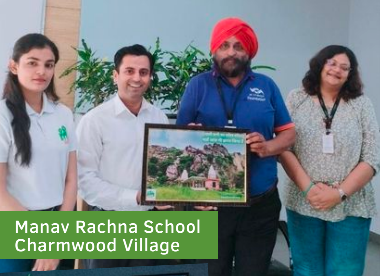
Manav Rachna School Charmwood Village