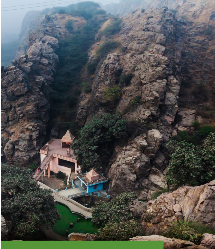
MOHBATABAD JHARNA TEMPLE

According to the legends related to the Mahabharata period, the waterfall called Mahabharata Carpet Waterfall is located in Mohbatabad village, Faridabad. It is said that when the Pandavas established the city of Indraprastha, they manifested many springs on this desolate aravali mountain through their penance. The Mohbatabad waterfall is one of them. It is also considered the Tapobhoomi (place of penance) of Udayalak Muni, and the cave where the sage meditated still exists with his idol installed, which is worshiped by people. Inside the cave, there is a massive rock that stands without any support, which is a significant attraction of this place. The waterfall used to flow throughout the year until 30 years ago.