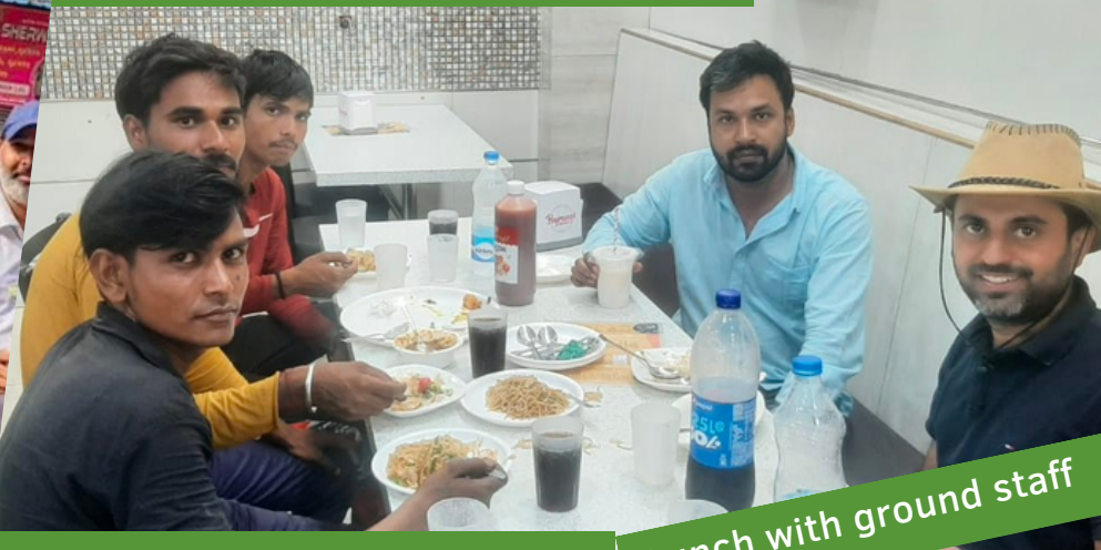
Raahgiri, Chandni Chowk